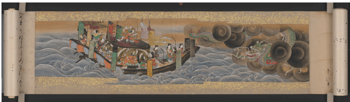
蓬莱物語 2巻 [ホウライ モノガタリ]. Kraft-Katalog Nr. 274; KS 7/295/4 (Muromachi monogatari); NSN 13f; Sawai 2 S. 101-130; Mjm 5 Nr. 103; A 27. Reprinted with kind permission of the Staatsbibliothek Preussischer Kulturbesitz Berlin (Libri japon. 450).

began to build boats is hardly reconstructable. Early sources, generally speaking, contain little evidence on ships or seafaring. The Yijing 易經 (chapt. Xici 系辭) traces ships for transportation purposes back to the time of the Yellow Emperor (Huangdi 黃帝). The Shijing 詩經 contains various references to boats and ships. 9 But these very short entries cannot provide any further information about shipbuilding; in addition, they mostly refer to river shipping. Various archaeological relics including boats, oars, and rudders 10 dating to periods between 6000 and 2000 BC, encouraged Chinese scholars to conclude that already during the earliest times of Chinese civilization, during the Xiantouling 咸頭嶺 culture (6500–5000 BC), in Guangzhou dug-out canoes were used to venture into the open waters. But even when we assume that these dates are correct, they do not allow any further conclusions concerning shipbuilding. Archaeologists furthermore found metal rings dating to the Warring States Period (475 or 463–221 BC) that supposedly were used to fortify ship planks. 11 But we do not possess any definite proof for this. It would seem to be safe to say only that by Shang times at the latest (16th–11th centuries BC) the coastal population used simple devices to float along the coastal waters. 12