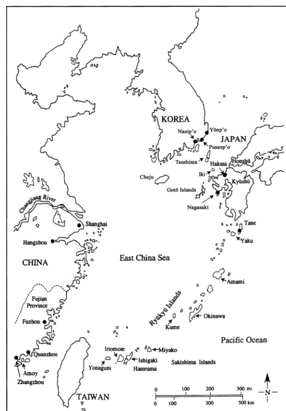
East China Sea Region

At the same time, it may at least not be neglected that during probably most of the time periods from antiquity through the middle to the early modern period it was in fact China that was the, if not always political, but at least economic and cultural centre of the macro-region, which – although it was undoubtedly primarily a continental power – was also quite active in maritime space.